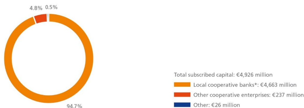
FIG. 2 – SHAREHOLDERS AS AT DECEMBER 31, 2020

The trading liabilities line item had contracted by €2.6 billion to €35.3 billion (December 31, 2019: €37.9 billion). Within this amount, repurchase agreements were down by €3.3 billion and structured fixed-term deposits were up by €1.1 billion.